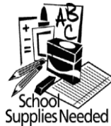
School Supplies Needed